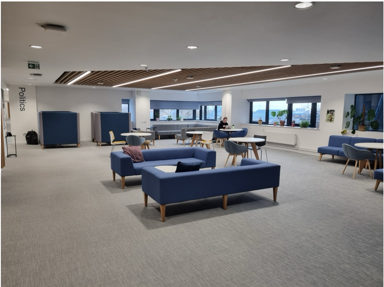
Exhibition space, Henry Daysh Building

Exhibitors will have access to WiFi and power supplies.